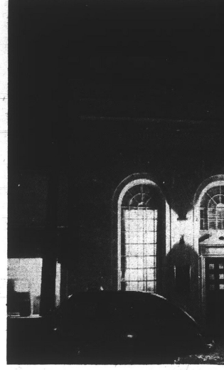
Here is an outside view of the Bank that is the entire community. The new arrangement of it facilities which include air conditioning for the c