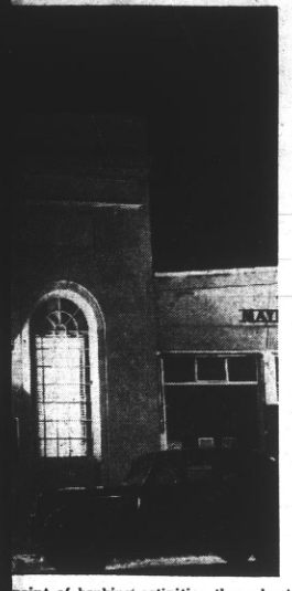
nt of banking activities throughout ords more room, and other increased