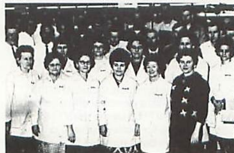
Staff of new Plated-Through-Hole Facility