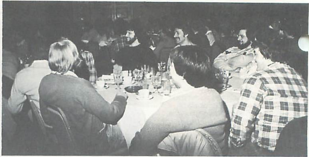
All Maynard Board Shop employees, over 300, were invited to a breakfast as a kick-off for the phase-out program on Feb. 15 at the Sheraton-Boxborough.

Reassignment strategies were developed for within the Plant as well as the rest of Digital. Internal movement is being continued on page 5