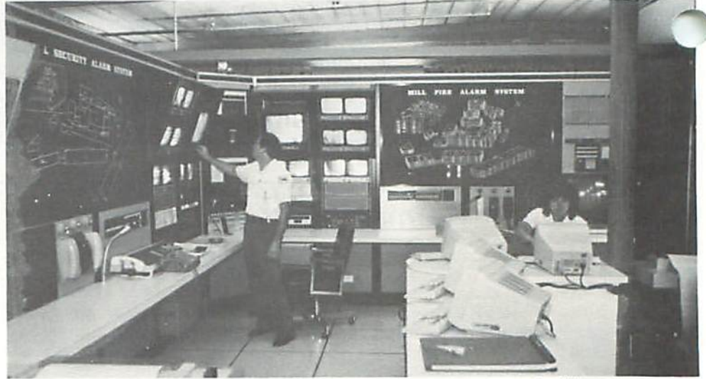
The base control center where the electronic security/fire system is located at the Mill complex.

"Utilizing the electronic equipment and radio communications between base control areas has enabled security forces to respond in an expedient and efficient manner during emergency situations. We have developed graphic displays where base control security officers can use their terminals to identify the exact location of all