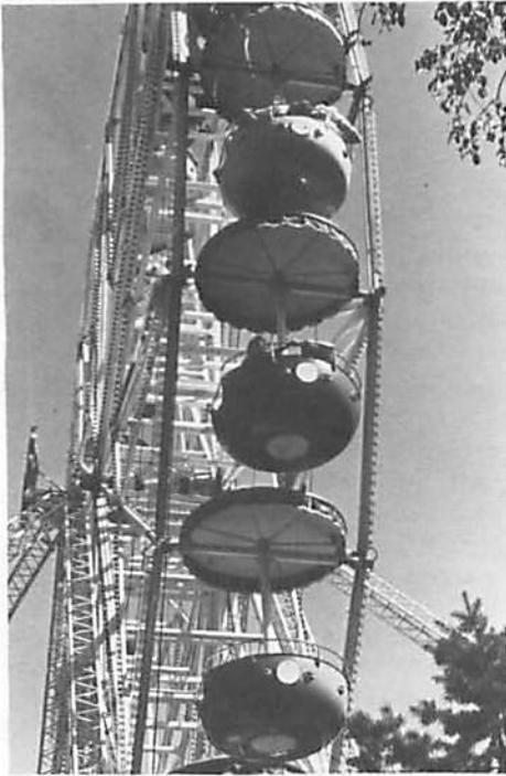
Employees waited in line as long as 45 minutes to ride on the Ferris Wheel.