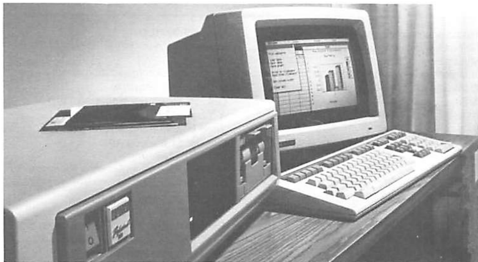
The new Professional 380 computer system more than doubles the performance of the previous top-of-the-line member of the Professional 300 computer family.

The new system is ideally suited for computer-intensive applications, ranging from mathematical calculations to complex graphical displays. It can be used as a stand-alone system or as an end-node element in an Ethernet® local area network