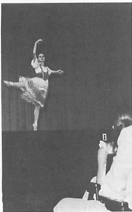
The Boston Ballet Ensemble performed at the Acton-Boxboro High School for Digital employees, family and friends. The event was the result of the company's sponsorship of their Esplanade series.