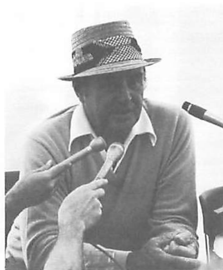
Sam Snead, winner of 84 tour titles starting back in 1936, drew a crowd of reporters at the press tent.