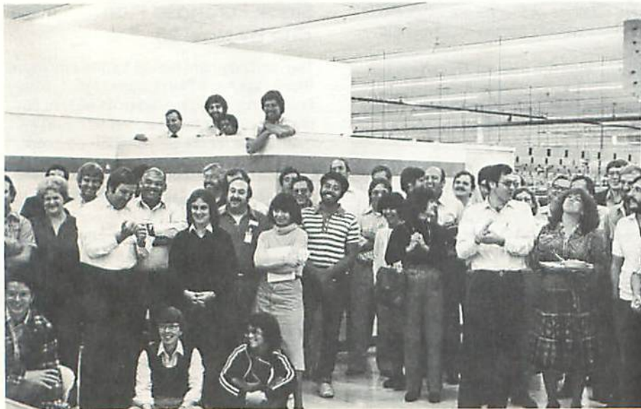
Acton employees backed their favorite contestant by buying tickets. A winner was drawn from the group who supported the winning pie eater.