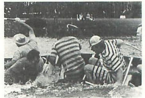
Every man for himself!