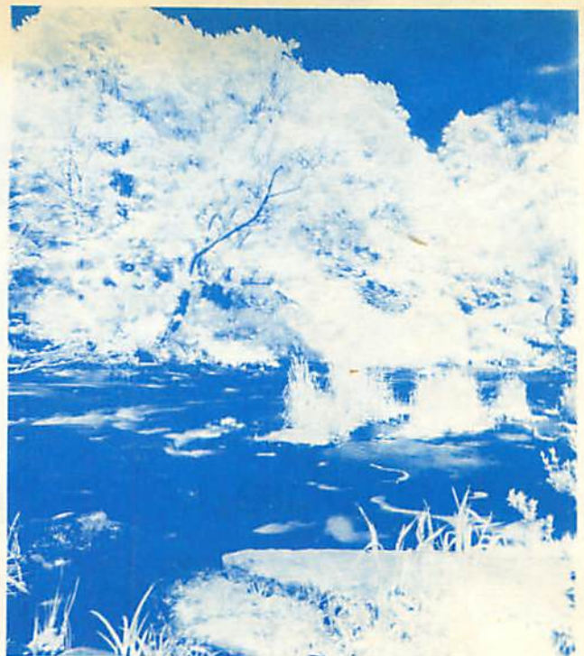
Digital Photographer Norman Beauchesne captured this nature scene of Maynard's Assabet River using a 4 x 5 Linhoff camera and high speed infrared film at 1/8th and f16.