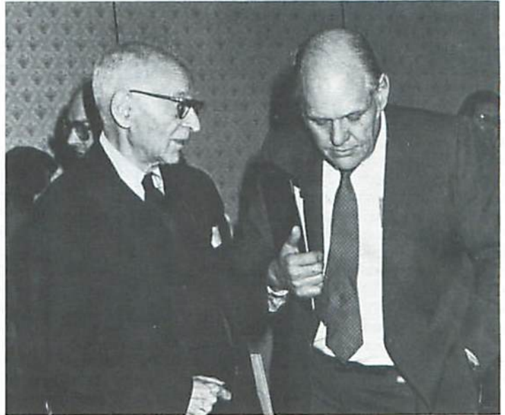
This photo of General Georges F. Doriot, left, and Digital President Ken Olsen, right, was taken at the Annual Meeting of Shareholders in November 1984. Ken says that the late General's thinking and the company's history and values are intertwined.

For 35 years, up until his retirement in 1966, General Doriot taught a course titled "Manufacturing," that was intended to