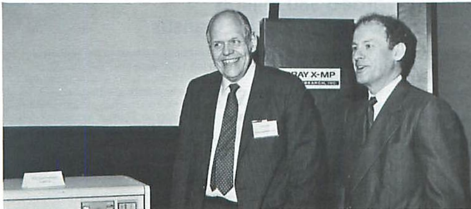
Digital President Ken Olsen, left, and John Rollwagen, right, president and chief executive officer of Cray Research, Inc., with the VAX Supercomputer Gateway, which was announced early this month as part of the two companies' marketing and product development agreement.

Digital and Cray Research, Inc., the leading producer of supercomputers, have announced an agreement to cooperatively market and develop computer products that link their respective computer environments.