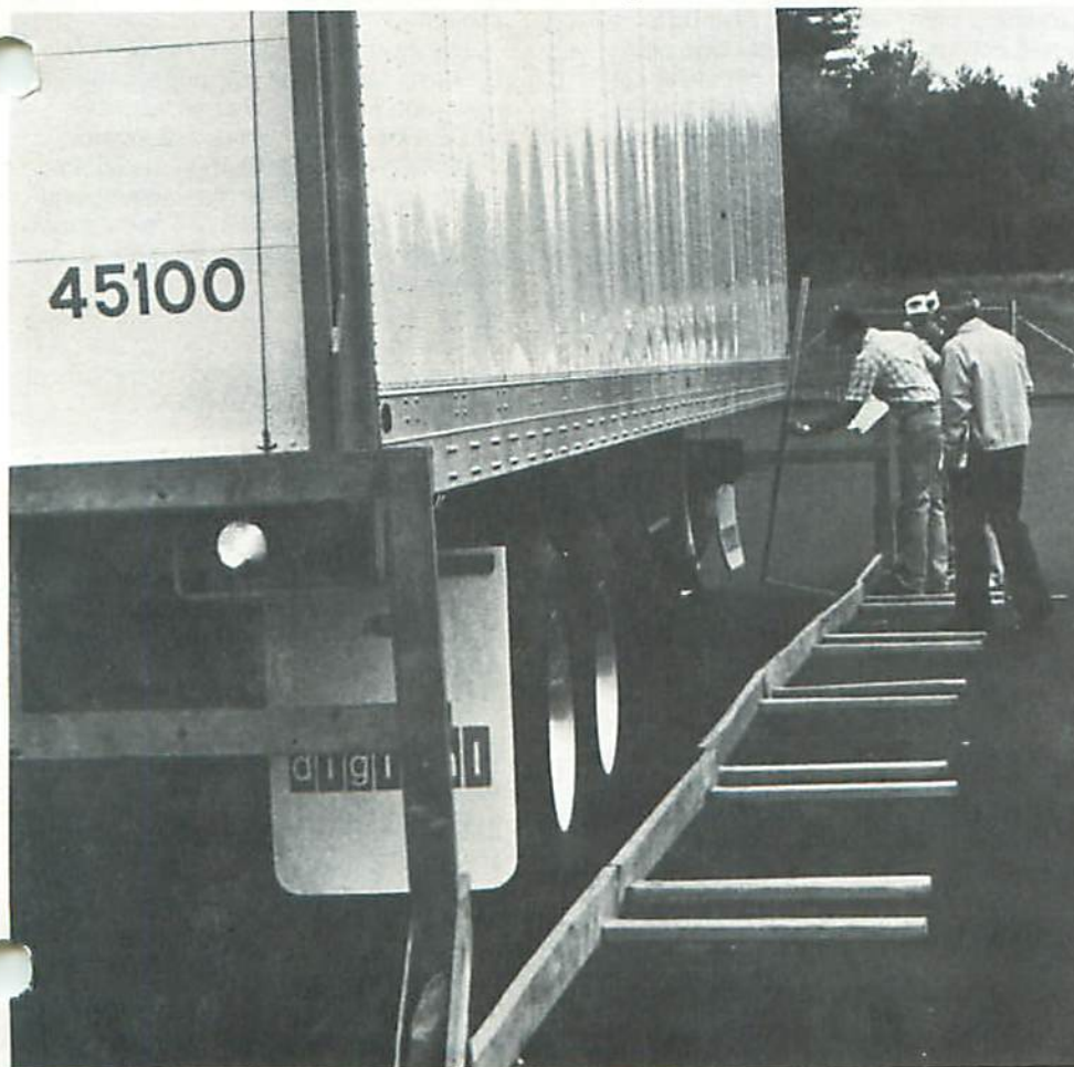
Parallel parking a 30-foot cab is just one of the many events Digital's fleet competed in during the 10th Annual Northboro Roadeo. More pictures are on page 5.