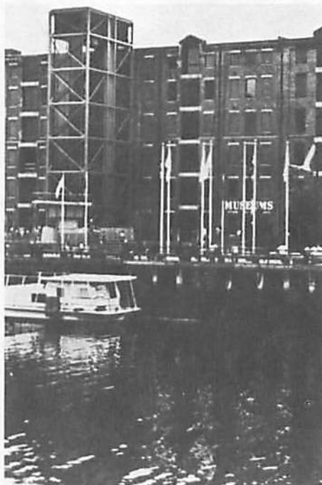
Picturesque Museum Wharf in downtown Boston will be the new home of the Computer Museum.

It is an international museum and archive for computing history, chronicling the evolution of information processing from the abacus to the silicon chip. Among