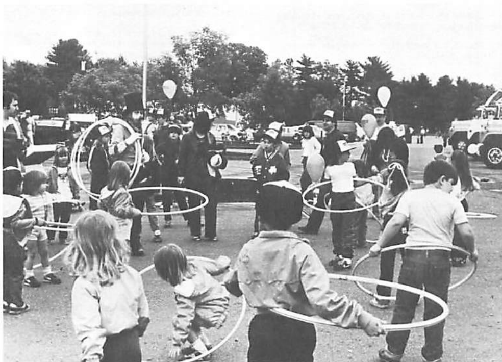
To the delight of children, Flippo the Clown leads a hula-hoop contest for little ones.