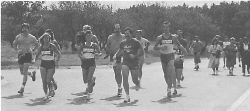
It was a perfect autumn day for the Stow Fun Run.