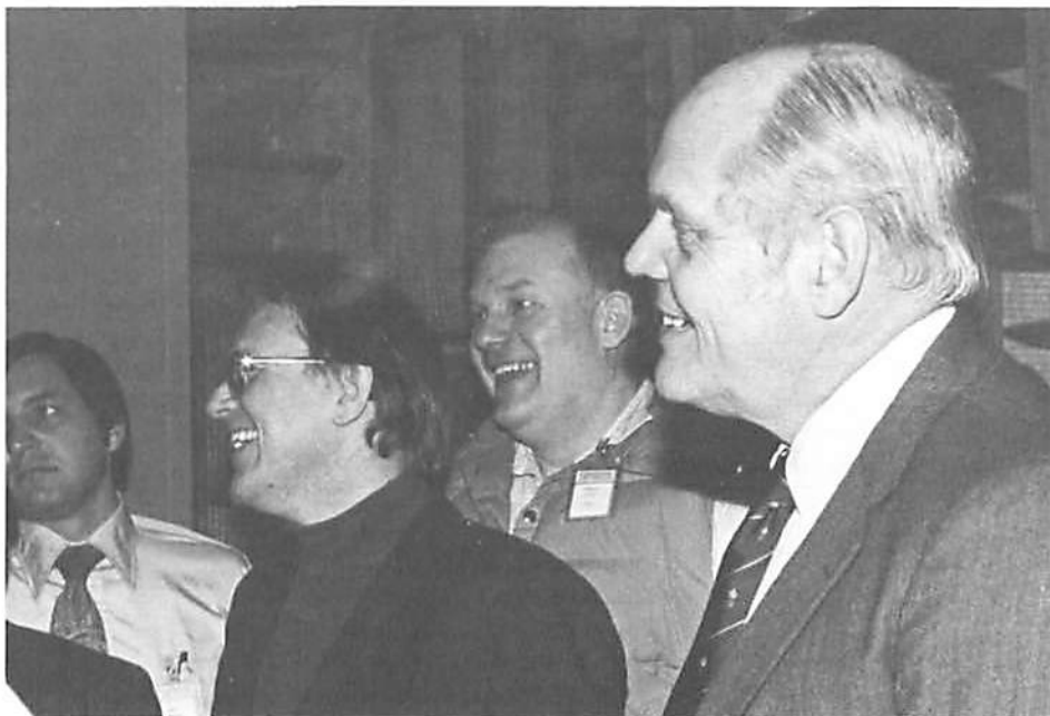
Gordon Bell, vice president, Central Engineering, (ctr.) and Ken Olsen (l.) join Product Acoustics Group and guests at the opening of the group's new lab in the Mill.

Digital operations are not usually affected by adverse weather conditions. But in the case of severe weather, work or shift cancellations will be announced on WBZ radio, 1030 AM on the dial. Please do not call your facility for this information.